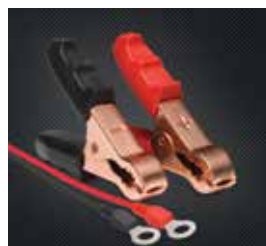
DC Charging Clamps and Quick connect ring terminals - 6 Amp model only