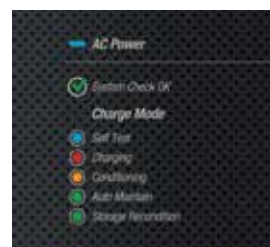
Charge Mode Status Indicator identifies each stage of charging