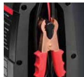
Easy Cable Storage Wrap around cable design